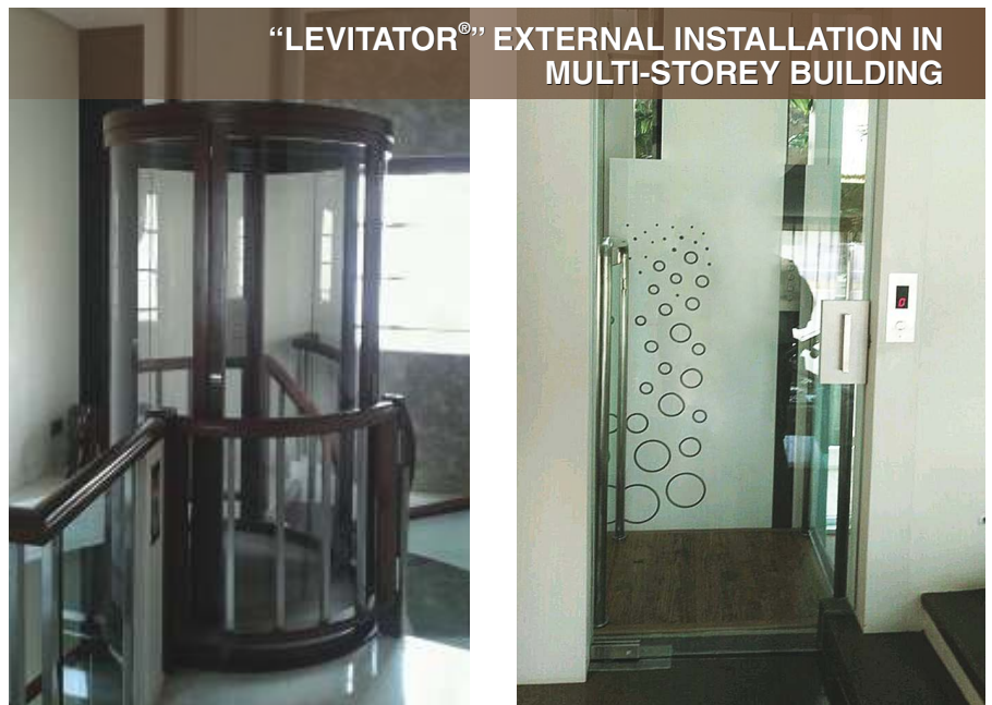
"LEVITATOR®" EXTERNAL INSTALLATION IN MULTI-STOREY BUILDING