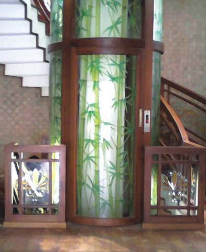
“LEVITATOR®” EXTERNAL INSTALLATION IN BUNGALOW